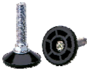
Adjustable Stopper Feet

Frame: Steel Others: SPCC cold rolled steel Thickness: Profile - 0.08" (2.0 mm), Angle - 0.06" (1.5 mm), Side Panel - 0.03" (0.8 mm), others - 0.05" (1.2 mm)