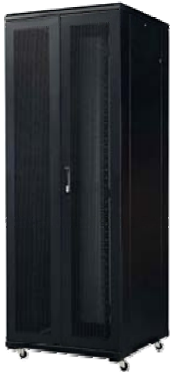
42U 800mm Width